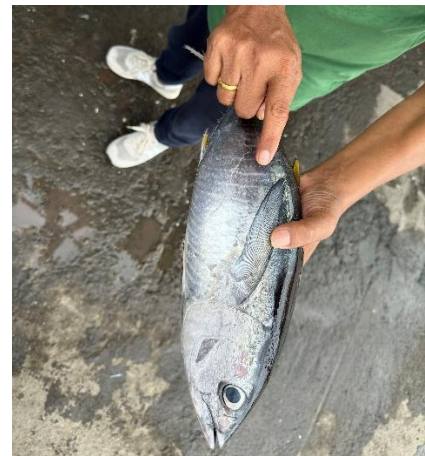
Juvenile YFT or BET?