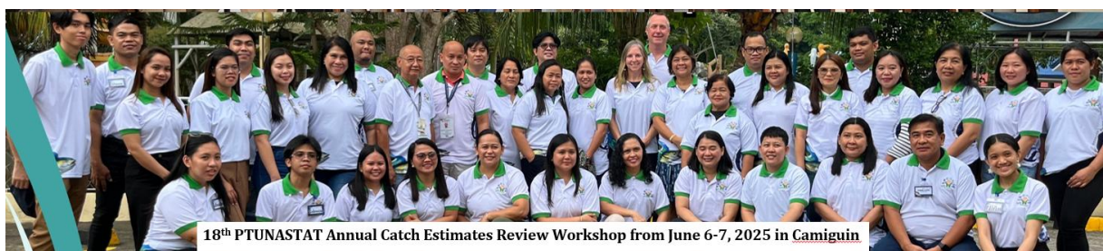
18 th PTUNASTAT Annual Catch Estimates Review Workshop from June 6-7, 2025 in Camiguin