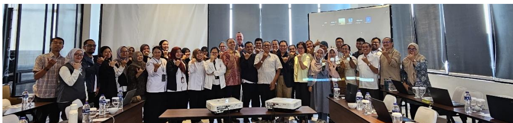
16 th Annual Catch Estimates Workshop, Bogor, Java