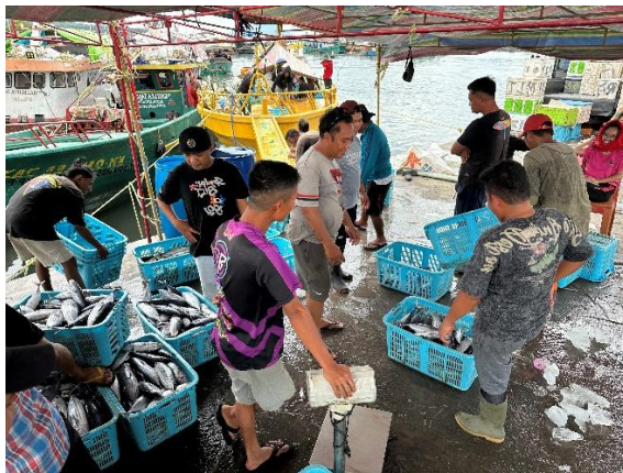
Tumumpa Fishing Port, Manado, Sulawesi