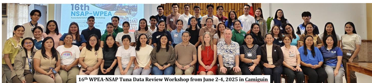
16 th WPEA-NSAP Tuna Data Review Workshop from June 2-4, 2025 in Camiguin